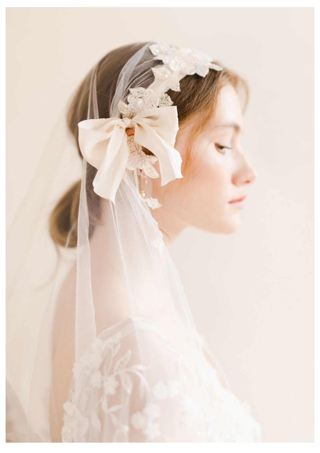
Personal packages available to suit your requirements.